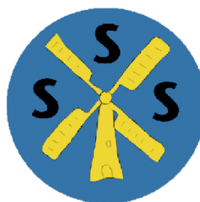
Shepeau Stow Primary School

Our Vision is to provide all members of the school community with the opportunities to engage with 'life in all its fullness' (John 10:10) by igniting imagination and curiosity which builds an enduring passion for life-long learning.