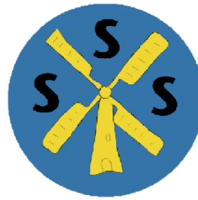
Shepeau Stow Primary School

Our Vision is to provide all members of the school community with the opportunities to engage with 'life in all its fullness' (John 10:10) by igniting imagination and curiosity which builds an enduring passion for life-long learning.